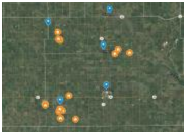
Homestead, land ownership and Cemetery map. (2018.48)