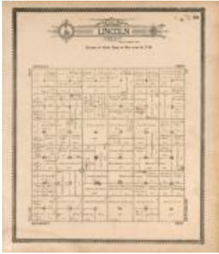
Douglas County, Lincoln Township - Plat Map - 1909-1910 (2016.60)