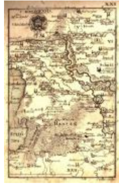
Austria - Burgenland Province (Castle Country) - 1800 (2016.61)