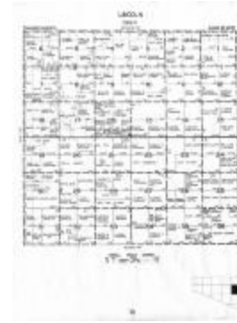
Plat Map. Lincoln Township, Douglas County, South Dakota. Date unknown, before 1960. (2018.33)