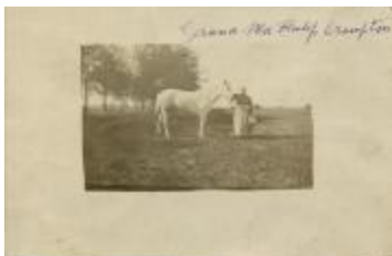
Catherine (Anglum) Crampton with a white horse. (2016.65)